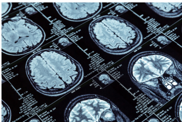
Results from MRI scans.

Your initial diagnosis of a glioma may change to oligodendroglioma after the biopsy/surgical resection and test results are complete.