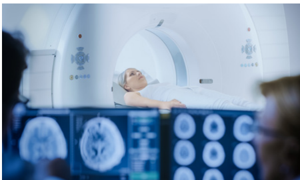
Patient entering MRI machine.

typically have an MRI. Although an MRI is preferred, a CT scan is quicker. These imaging tests can be used with or without contrast, which is a dye that makes the pictures more clear. 8