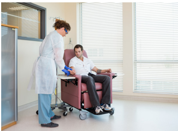
Nurse prepares patient for IV/infusion chemotherapy.

Talk to your doctor about the different types of chemotherapy and possible side effects.