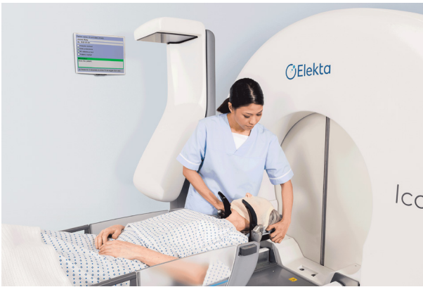
Gamma Knife ® used to deliver SRS therapy.

The SRS treatment will take place in a special treatment room. 16 If having SRS using focused gamma beams, the patient is positioned on a bed that slides into the machine.